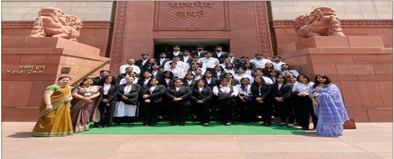
Students and faculty from the Department of Law during their insightful visit to Rashtrapati Bhavan, Raisina Hill, New Delhi, on 25th February 2025.

Deepen students understanding of India's political history and governance by providing first hand exposure to Rashtrapati Bhavan. Familiarize students with the historical context and constitutional role Rashtrapati Bhavan, one of the most important symbols of India's democracy.