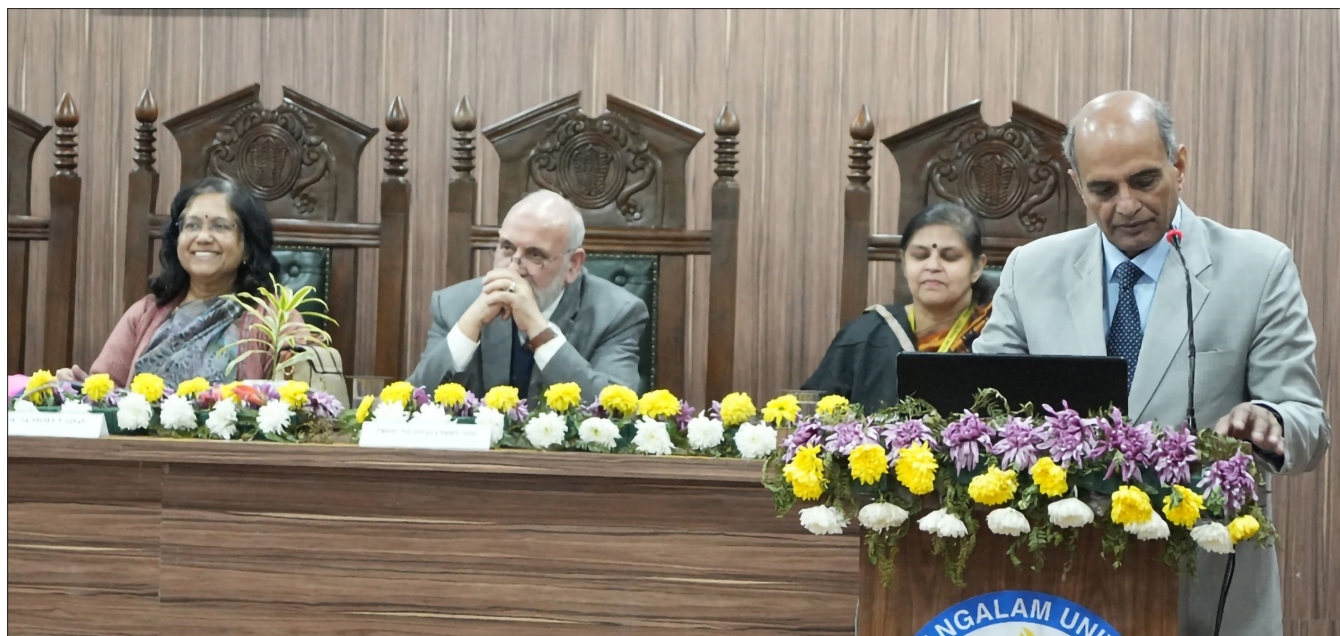
Hon'ble Vice Chancellor of K.R. Mangalam University, addressing the gathering during a distinguished academic event, accompanied by esteemed guests and faculty members on the dais.