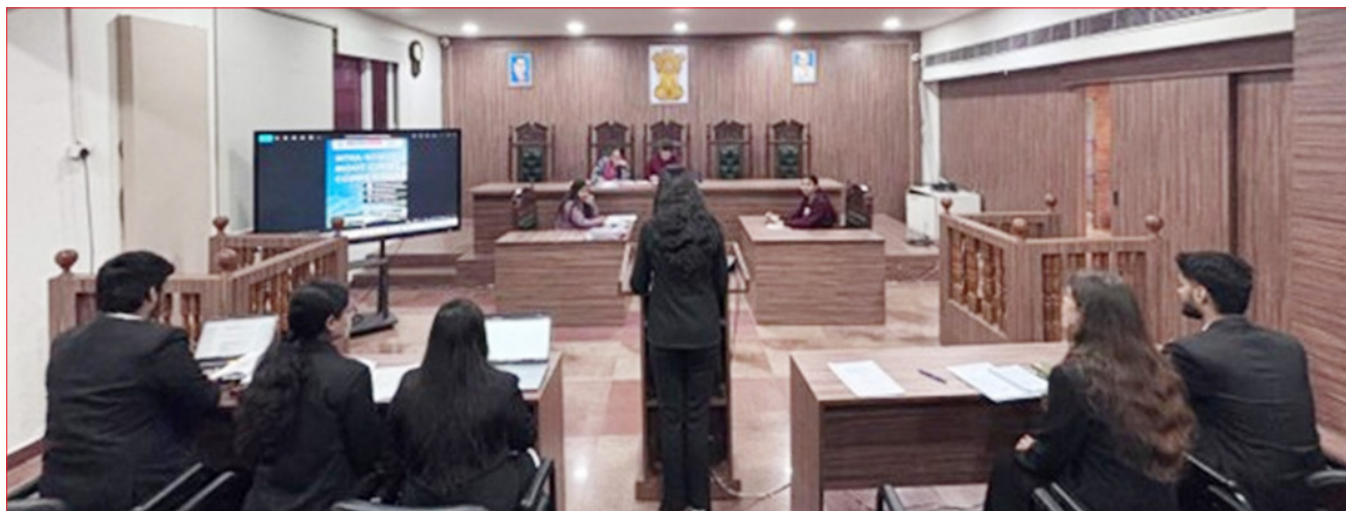
Intra-School Moot Court Competition held at the School of Legal Studies, Sohna, Haryana, on 5th February 2025

Mooting is a great way to develop one's confidence, speaking, writing skills and research. and arbitrators. in Moot court is not just great for budding advocates but also for future judges Court Committee, Court Competition. School of Legal Studies organized Intra School Moot The students were given moot problem on the constitutionality Act passed by of a new the parliament.