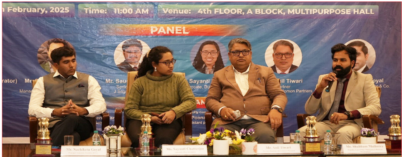
Panel Discussion: Bridging the Gap – Navigating Internship Opportunities for Law Students

The panel discussion with such eminent speakers, where students also asked various questions regarding how to approach a law firm for internships, what are the qualities that a law firm look for while selecting and answered the students' questions with enthusiasm, they mentioned the importance of Legal Research and gave their opinions about the requirements of a great resume build-up.