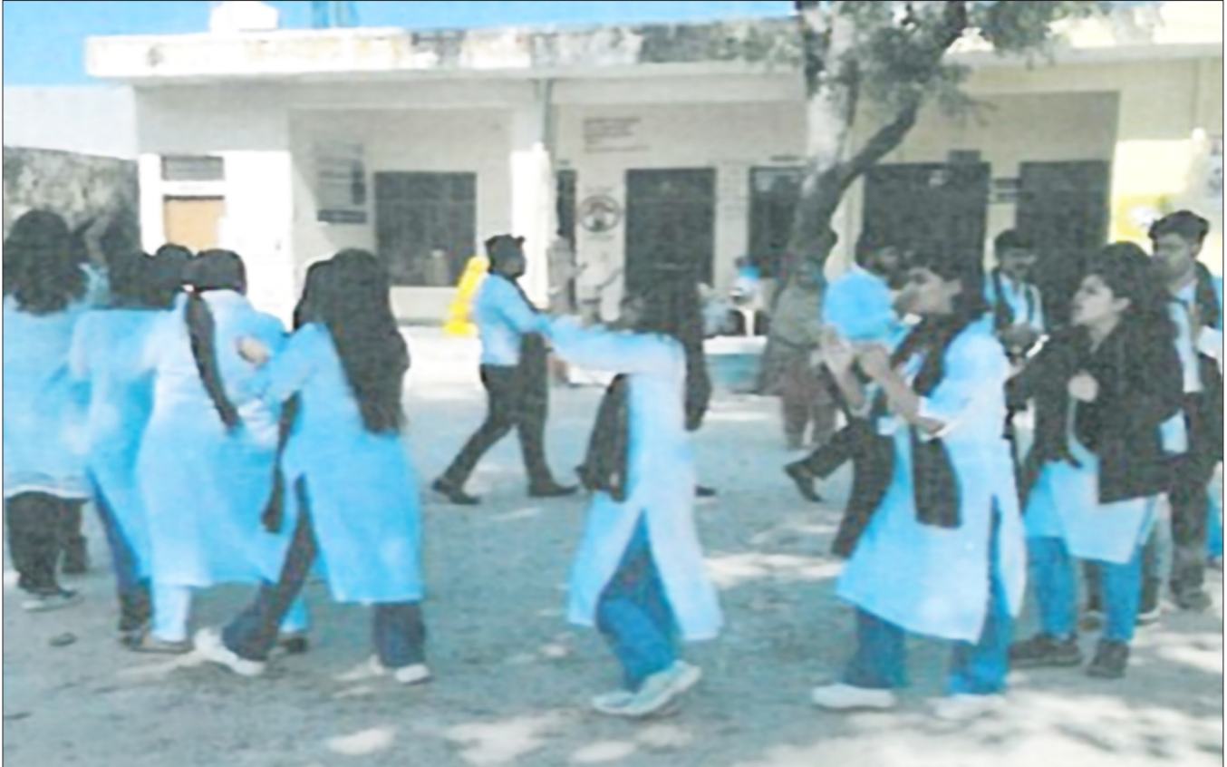
Nukkad Natak by SOLS students as an awareness drive

In a significant step toward strengthening access to justice through technology, a two-day Legal Awareness Camp was organized on 6th and 7th February 2025 focusing on the Nyaya Bandhu (Pro Bono Legal Services) mobile application. The camp aimed at spreading awareness about the Government of India's innovative digital platform designed to connect citizens in need of legal assistance with pro bono advocates across the country. The camp was conducted by faculty members and law student volunteers who demonstrated the functionality, benefits, and registration process of the Nyaya Bandhu mobile application. The primary objective was to empower the community with knowledge of how to seek legal help remotely and effectively, especially in rural and underserved areas.