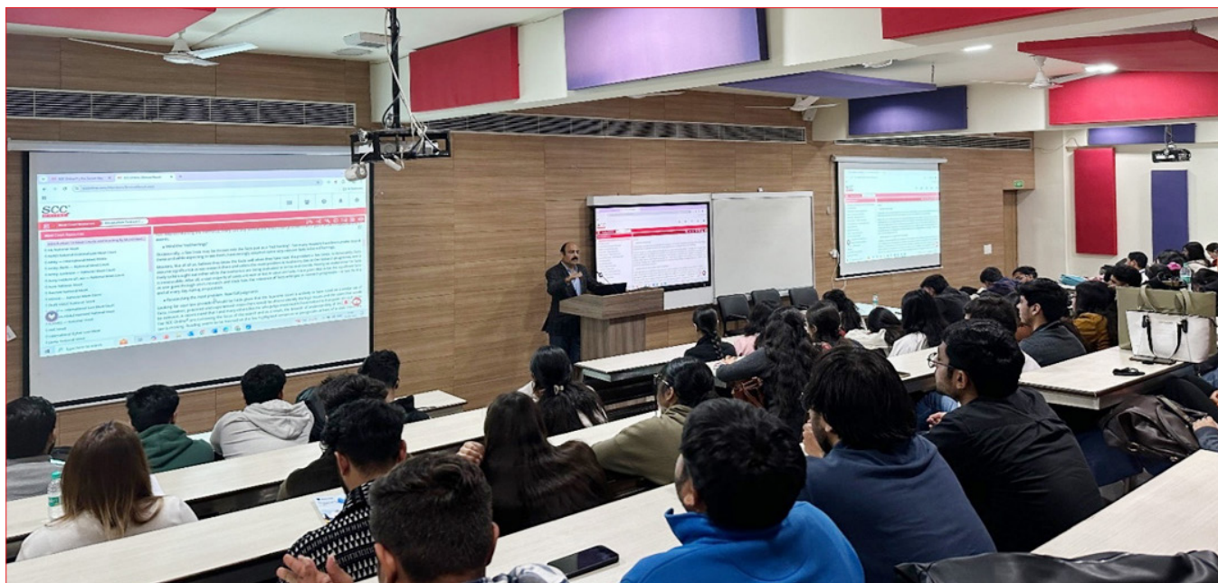
Intra-School Moot Court Competition held at the School of Legal Studies, Sohna, Haryana, on 5th February 2025

The primary objective of the workshop was to familiarize students with the features and functionalities of SCC Online, enabling them to navigate and utilize the platform effectively. The workshop will help improve their research efficiency in retrieving legal cases, judgments, and statutes, ensuring a streamlined and systematic approach to legal research.