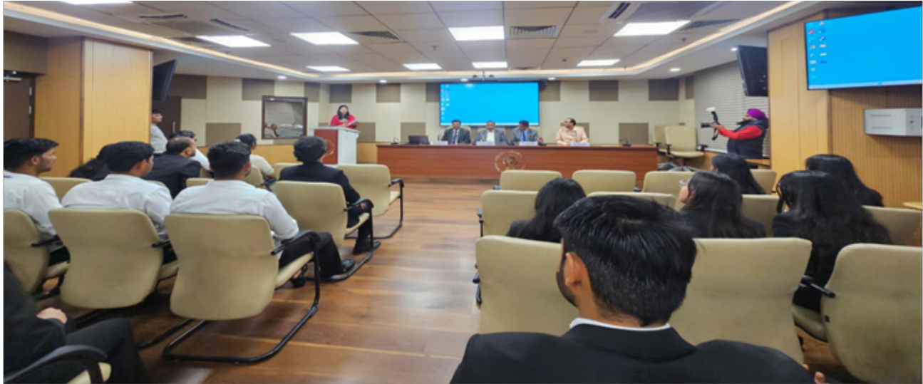
Orientation session in progress at the NHRC Conference Hall, led by senior officials of the Commission.

Overall, the educational visit proved to be a transformative learning experience, enhancing students' understanding of human rights governance and inspiring them to pursue justice-oriented and socially responsible legal careers.