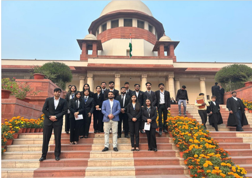
Students along with the faculty coordinators at supreme court of India

The School of Legal Studies, K.R. Mangalam University, organized an educational visit to the Supreme Court of India on 2nd December 2025 for third-semester law students. The visit aimed to provide first-hand exposure to the structure and functioning of the highest judicial authority in the country. Students observed live courtroom proceedings, gaining valuable insights into oral arguments, judicial interactions, and courtroom dynamics. They also interacted with legal professionals, including Senior Advocate Mr. Gaurav Bhatia, who shared insights into the Supreme Court's role in constitutional governance. The visit included tours of courtrooms, the library, and the Supreme Court Museum, enriching students' understanding of landmark judgments and judicial history. The experience proved to be highly informative and inspiring, bridging the gap between theoretical learning and practical legal exposure.