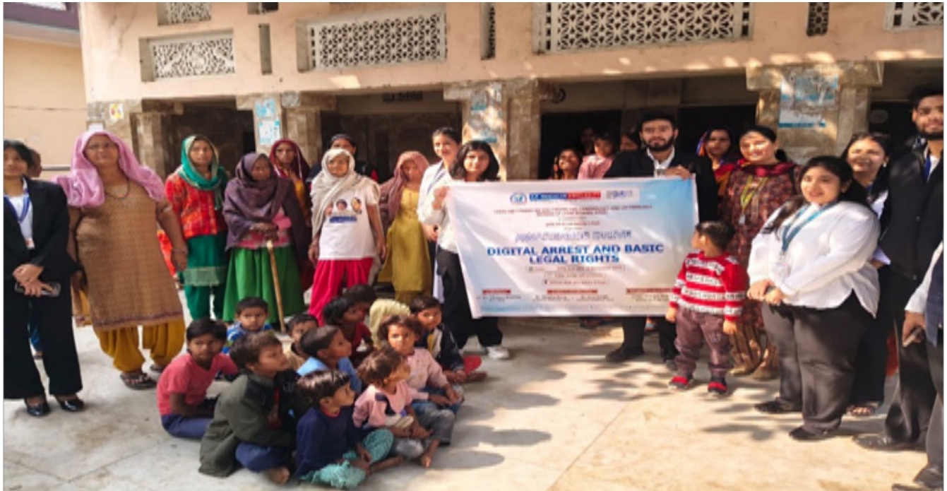
Students interacting with villagers during the awareness drive on Basic Legal Rights

School, Nuh, sensitizing school students to cybercrime risks, digital arrest scams, and safe online practices, with guidance on reporting mechanisms such as the Cyber Crime Helpline. Further extending its outreach, the School of Legal Studies, in collaboration with the Youth Red Cross Society, organized a Mega Legal Aid and Medical Camp on 3 December 2025 at Government Senior Secondary School, Dauhla, Gurugram, combining legal literacy sessions, a Nukkad Natak, on-the-spot legal assistance by DLSA advocates, and basic medical check-ups. Collectively, these initiatives enhanced legal awareness, promoted responsible digital behaviour, and reflected the university's strong commitment to community engagement and social responsibility.