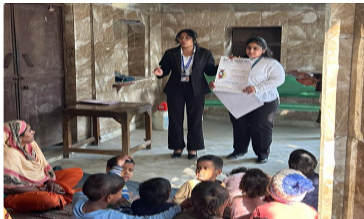
Student Member explaining about free legal aid services and helpline numbers to community members.