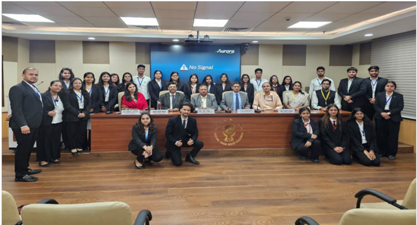
Group photograph of students and faculty of the School of Legal Studies with NHRC Officials.