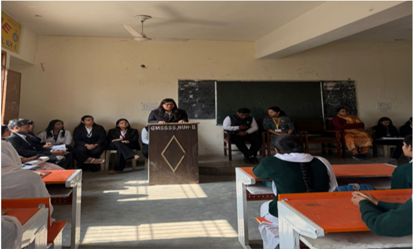
Student members interacting with senior secondary students during the Awareness Drive on Digital Arrest.