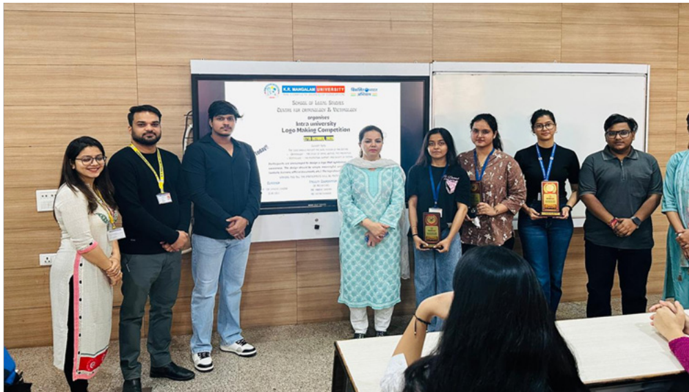
Faculty coordinators with the student Winners of the Intra-University Logo Making Competition

Overall, the Logo Making Competition was a great success, receiving positive appreciation from participants and faculty alike, and reaffirming the University’s focus on nurturing creativity alongside academic excellence.