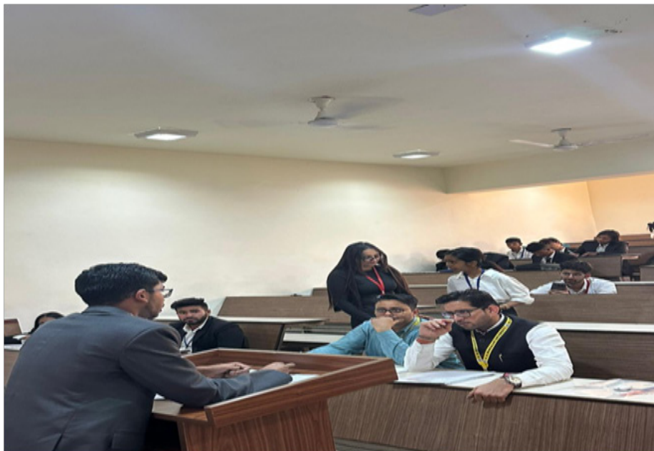
Faculties Judging and evaluation the arguments of the team.