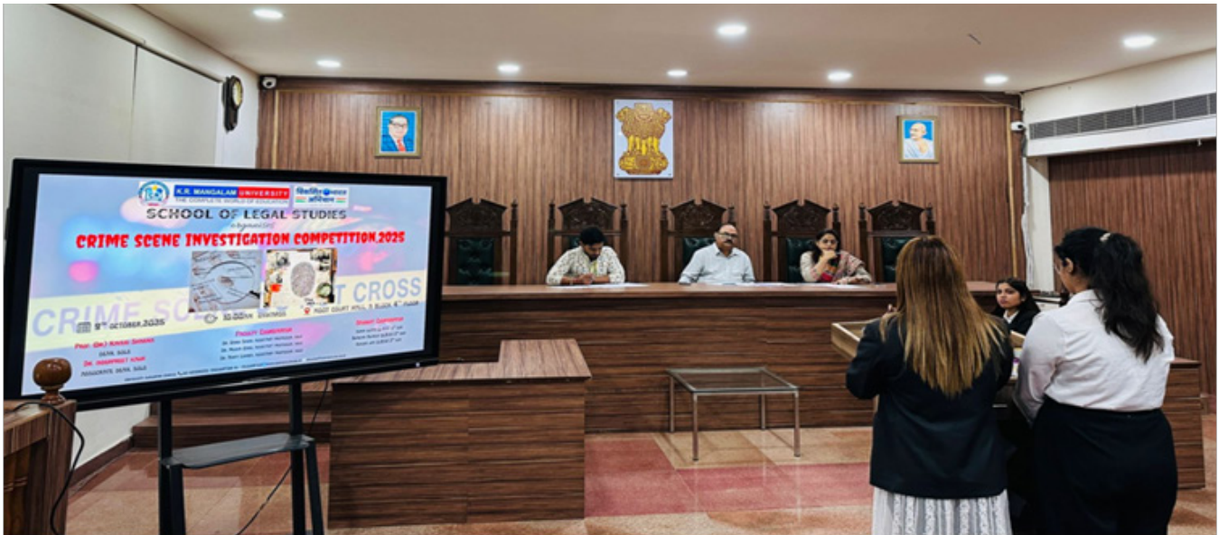
Team presenting their evidence before judges.

The Centre for Criminology and Victimology, School of Legal Studies, K.R. Mangalam University, organized an intra-university Crime Scene Investigation (CSI) Competition on 9 October 2025 at the Moot Court Hall. The event provided law students with hands-on exposure to forensic investigation and evidentiary analysis through a simulated murder case scenario. Participants worked in teams to examine clues, analyze forensic evidence, identify suspects, and present logical conclusions before a panel of judges. The competition successfully bridged theory and practice, enhancing students' analytical thinking, teamwork, and understanding of criminal investigation and evidence law. The event concluded with the declaration of winners and appreciation from the judges for the participants' commendable performance and investigative skills.