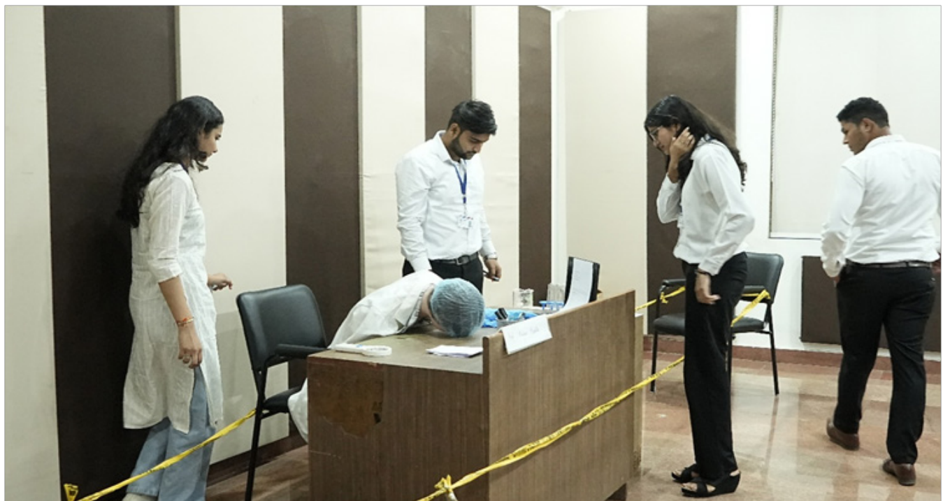
Participants collecting clues from crime scene.