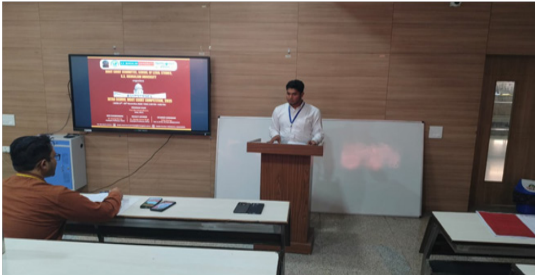
Faculties Judging and evaluation the arguments of the team.

Aligned with SDGs 4, 5, 10, and 16, the competition served as a robust platform for experiential legal learning, inclusivity, and promotion of justice-oriented legal education. The event concluded successfully with recognition of outstanding mooters, teams, researchers, and memorials, reinforcing SOLS' commitment to academic excellence and practical legal training.