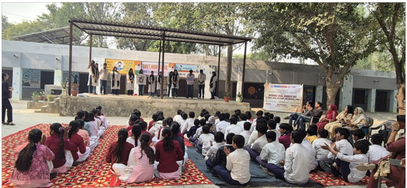
Students actively participating in the session on identifying digital scams and impersonation frauds.