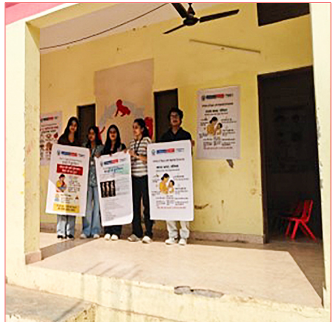
Student volunteers conducting an awareness drive on child nutrition and malnutrition in Abheypur village, engaging with school children and displaying informative posters to promote healthy practices and community well-being.