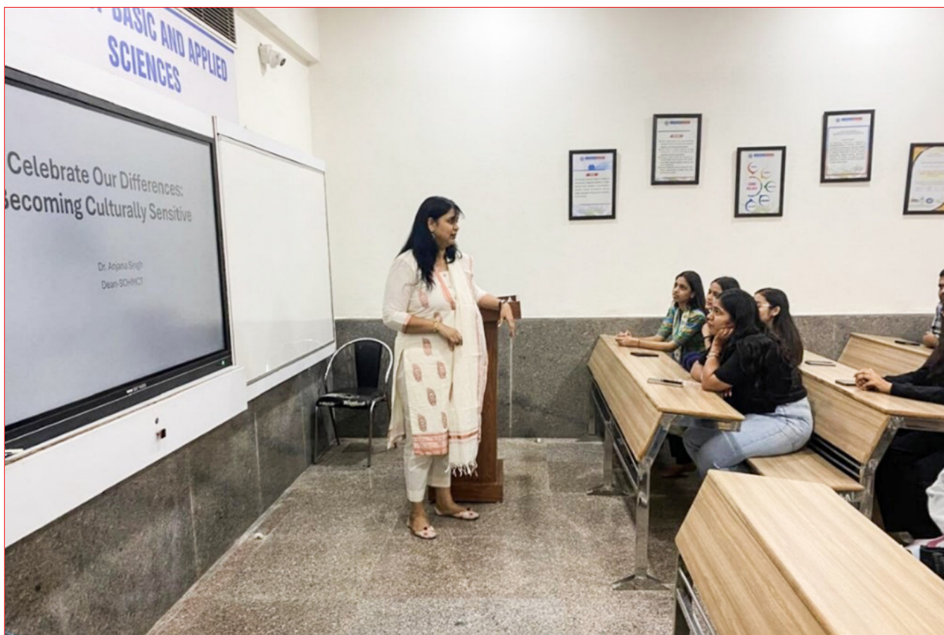
An insightful seminar session on cultural sensitivity, where the resource person engages students in meaningful discussion on inclusivity and respect for diversity during the academic program.

responsible campus. Through interactive discussions and real-life examples, students explored the significance of unbiased thinking and ethical conduct, particularly in fields like forensic science. The event aligned with SDG 4 (Quality Education), SDG 10 (Reduced Inequalities), and SDG 16 (Peace, Justice, and Strong Institutions) by promoting inclusive values, reducing biases, and encouraging socially responsible behavior. Overall, the seminar successfully enhanced students’ awareness of cultural diversity, strengthened their communication and ethical perspectives, and fostered a positive attitude toward inclusivity, empathy, and responsible citizenship in both academic and professional contexts.