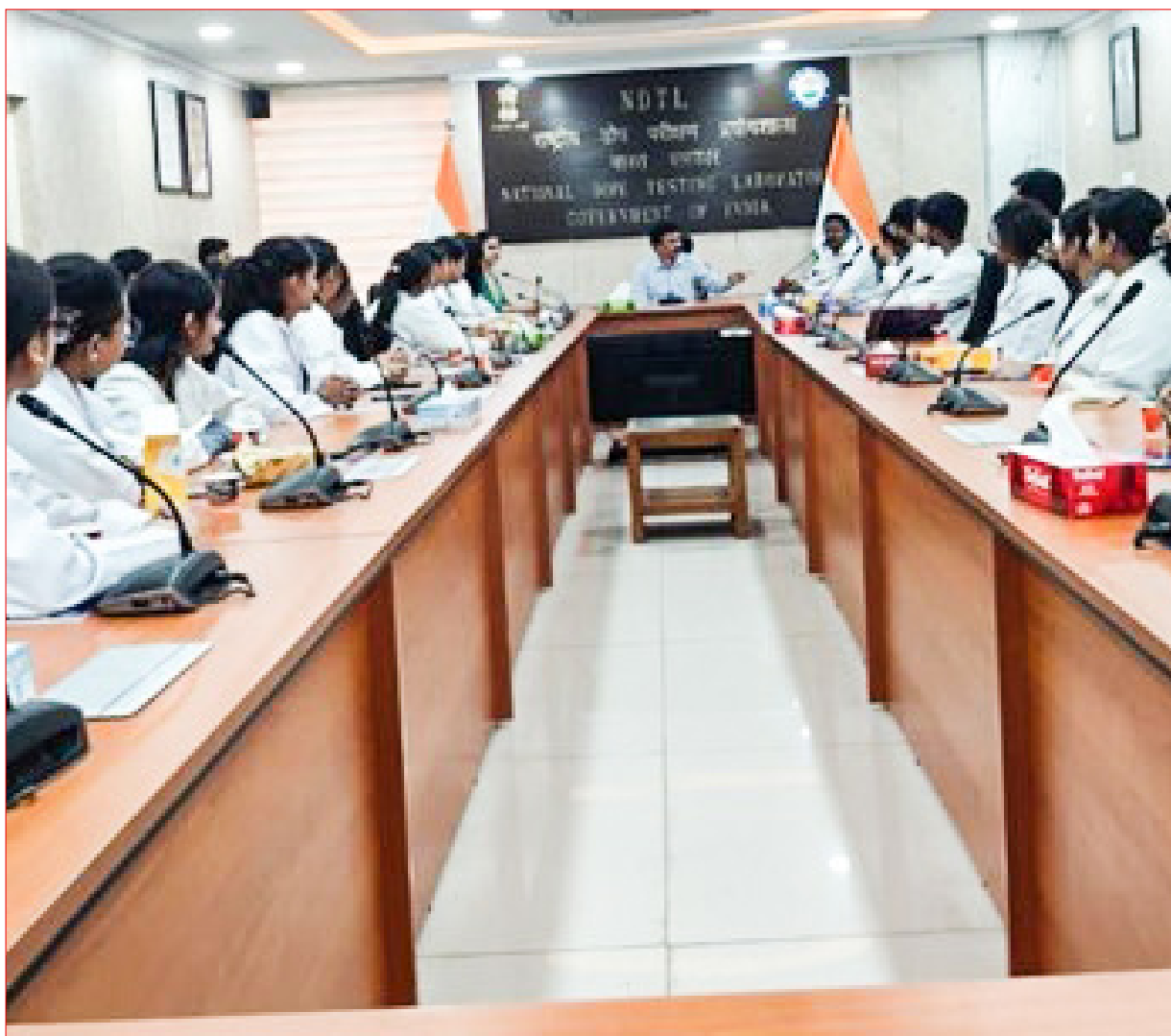
Students attending an informative session during the industrial visit to the National Dope Testing Laboratory, gaining insights into anti-doping procedures, laboratory protocols, and advanced analytical techniques.

significance of the laboratory in compliance with WADA standards. Students observed key processes including sample receipt, where athlete samples are collected in sealed A and B bottles with proper documentation through the Doping Control Form, ensuring chain of custody and sample integrity. The visit provided valuable insights into the rigorous scientific protocols, quality control measures, and ethical standards followed in anti-doping analysis. Overall, the experience was highly enriching, bridging the gap between theoretical knowledge and practical application, and highlighting the critical role of forensic science in ensuring fairness, transparency, and integrity in sports.