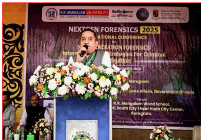
Glimpses from NextGen Forensics 2025 International Conference, showcasing the felicitation of distinguished dignitaries during the inaugural session and an insightful address by an eminent speaker highlighting advancements in forensic science and interdisciplinary investigation.