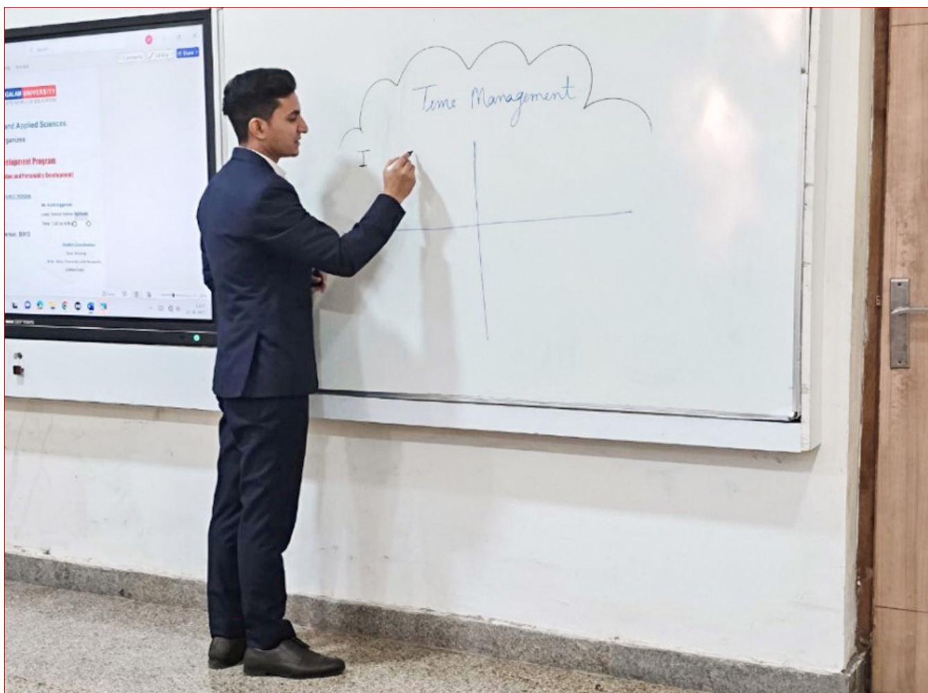
A resource person conducting an engaging session on time management during the Capacity Development Program on soft skills, guiding students through practical strategies for prioritization and productivity.

and practical exercises that encouraged self-reflection, collaboration, and confidence-building. Key highlights included understanding the importance of prioritization (important vs. urgent tasks), effective communication strategies, emotional intelligence, and leadership qualities required for professional success. The program successfully improved students’ awareness and application of soft skills boosted motivation for personal growth and strengthened their readiness for workplace challenges. It also aligned with SDG 4 (Quality Education), SDG 8 (Decent Work and Economic Growth), and SDG 10 (Reduced Inequalities) by equipping students with essential competencies for holistic development and employability.