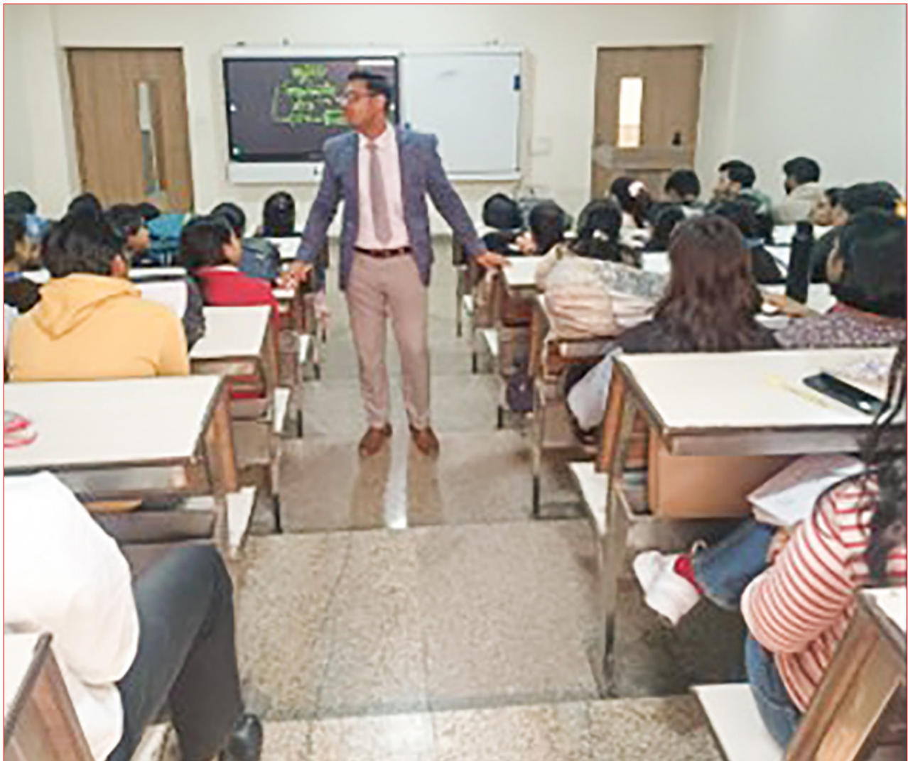
An interactive classroom session during the Capacity Development Program, where the resource person engages students in a discussion on digital forensics concepts, fostering active participation and experiential learning.

fundamentals, crime scene investigation and evidence handling, AI and machine learning applications in forensics, research and innovation in forensic technology, and future career prospects in forensic science. The sessions provided students with practical knowledge of digital evidence analysis, chain of custody, technological advancements, ethical considerations, and research opportunities, thereby strengthening their technical competence and awareness of cyber safety. Overall, the program successfully enhanced students’ readiness for real-world forensic challenges, encouraged innovation and research orientation, and highlighted the role of forensic science in building a secure, and justice-oriented society.