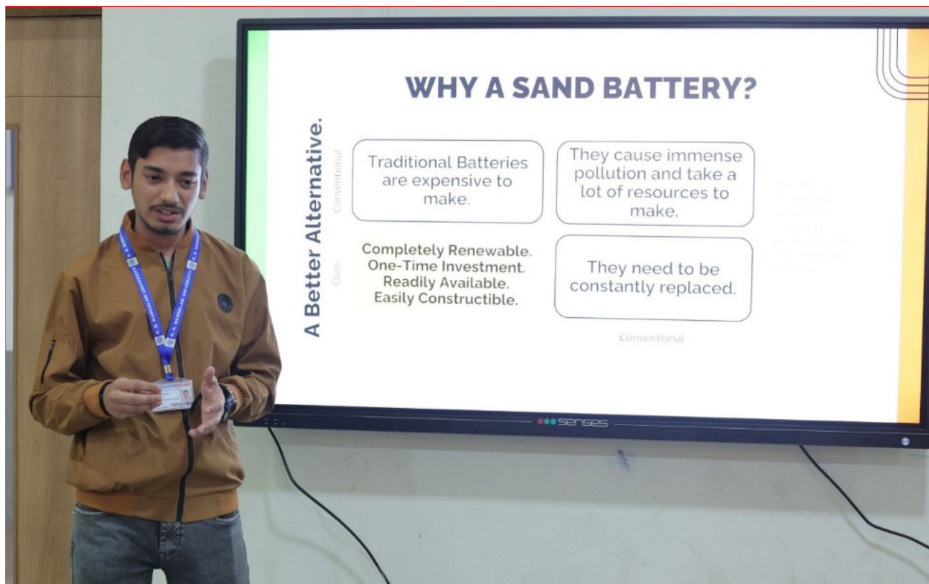
A student presenting an innovative idea on “Why a Sand Battery?” highlighting its sustainability, cost-effectiveness, and environmental advantages over traditional batteries.