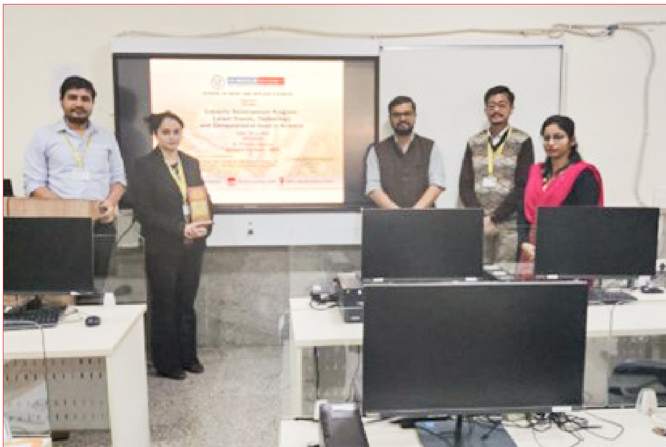
A Group Photograph during the Capacity Development Program on Latest Trends, Technology and Computational Tools in Science.

presentation tools, data analysis and graph fitting using Origin software, 3D scientific visualization through Blender, and effective scientific communication and presentation crafting. The sessions combined theoretical insights with hands-on demonstrations, enabling participants to understand the importance of clarity, accuracy, and visualization in scientific research and publications. The program significantly improved participants’ ability to handle data, interpret results, and present research professionally, while also fostering innovation, interdisciplinary learning, and technology-driven research approaches. Overall, the program successfully strengthened research competency, enhanced digital and analytical skills.