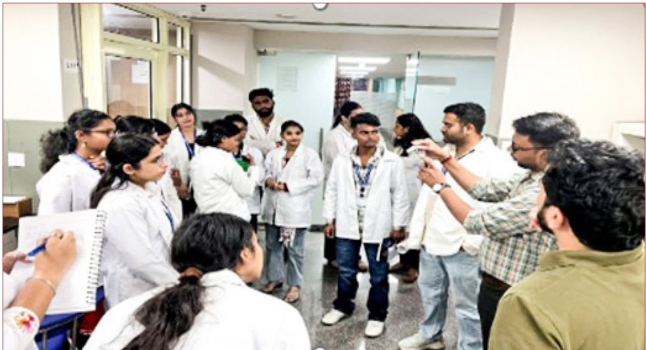
Students interacting with a forensic expert during an educational visit to the Forensic Science Laboratory, gaining hands-on exposure to real-time forensic procedures and evidence analysis techniques.

where experts demonstrated instruments such as ESDA, VSC, Genetic Analyzer, and RT-PCR, along with techniques like DNA extraction and differential washing in forensic casework. The interaction with forensic professionals enhanced students' understanding of standard operating procedures, chain of custody, and quality assurance practices, effectively bridging the gap between theoretical knowledge and practical application. Overall, the visit proved to be an enriching learning experience, strengthening students' technical competence, ethical awareness, and appreciation of the role of forensic science in the justice system, while aligning with SDG 16 (Peace, Justice and Strong Institutions).