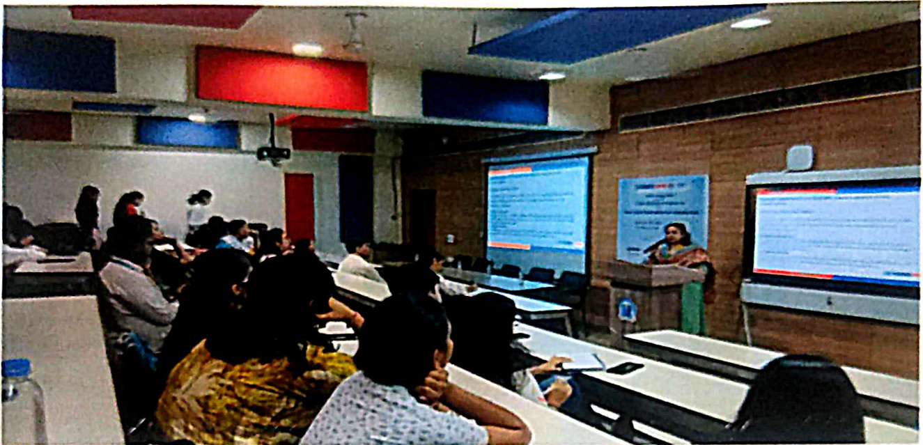
Active participation of the students during the session