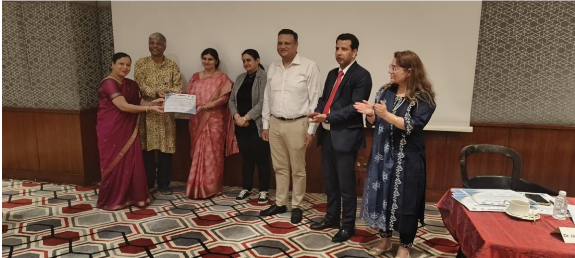
Pic 23- Best Paper Award