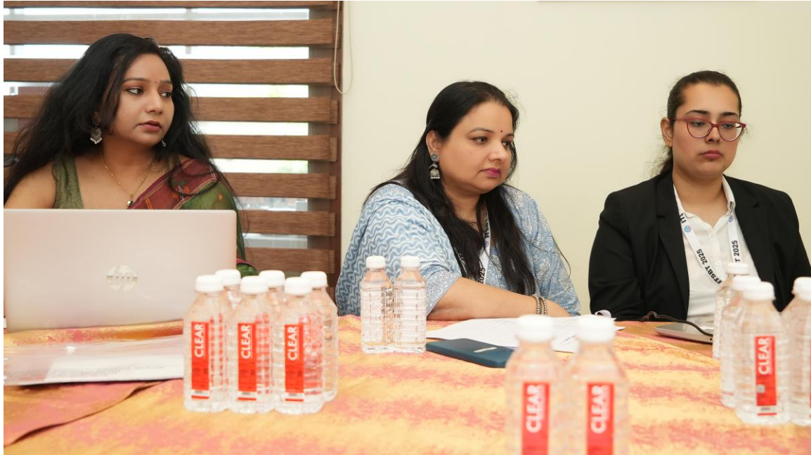
Pic 14- Online session