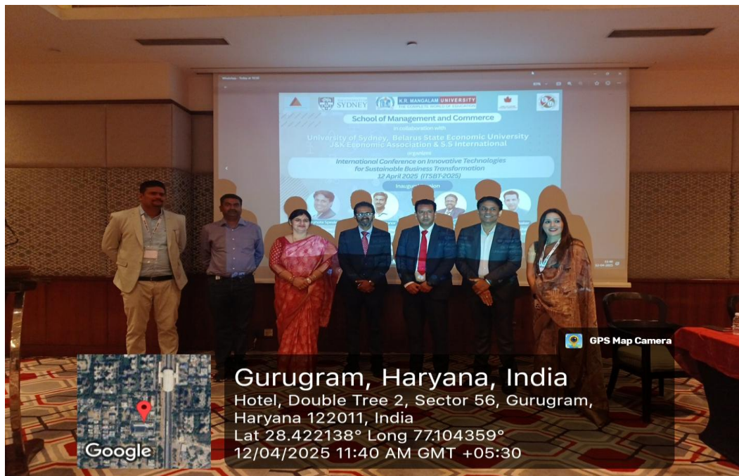
Pic3 - Group Picture