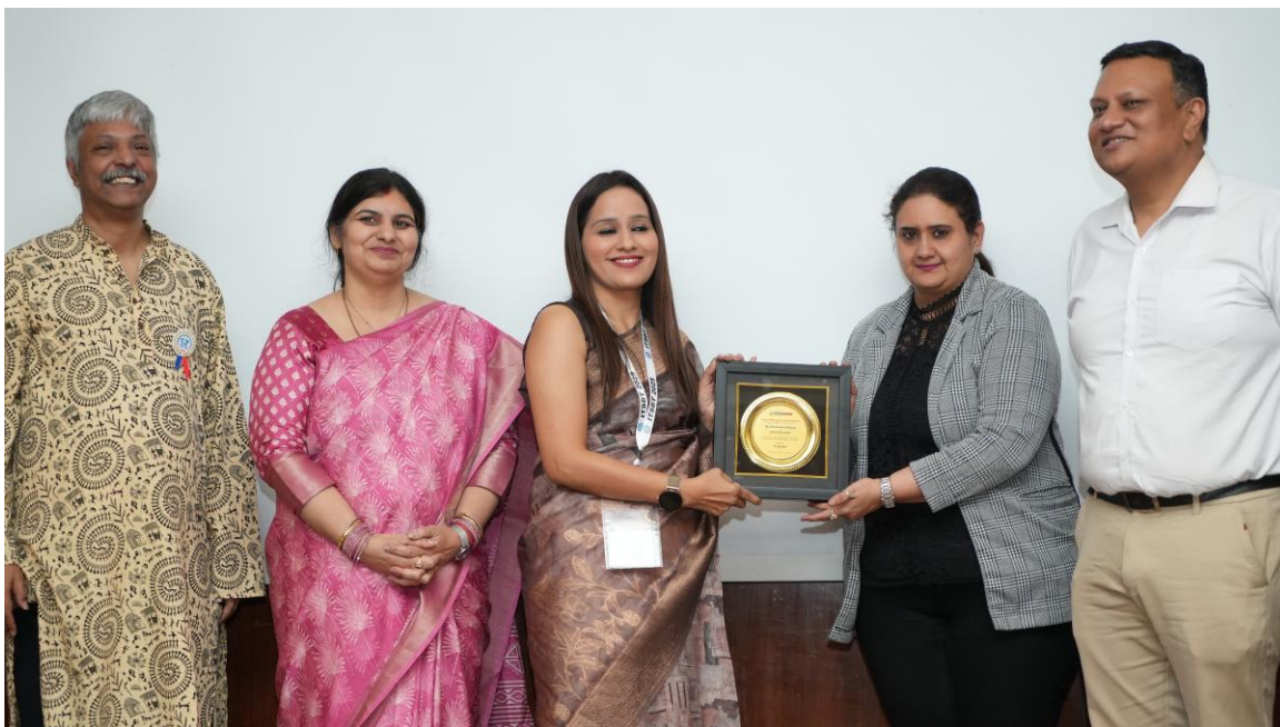
Pic 20- Memento Presentation