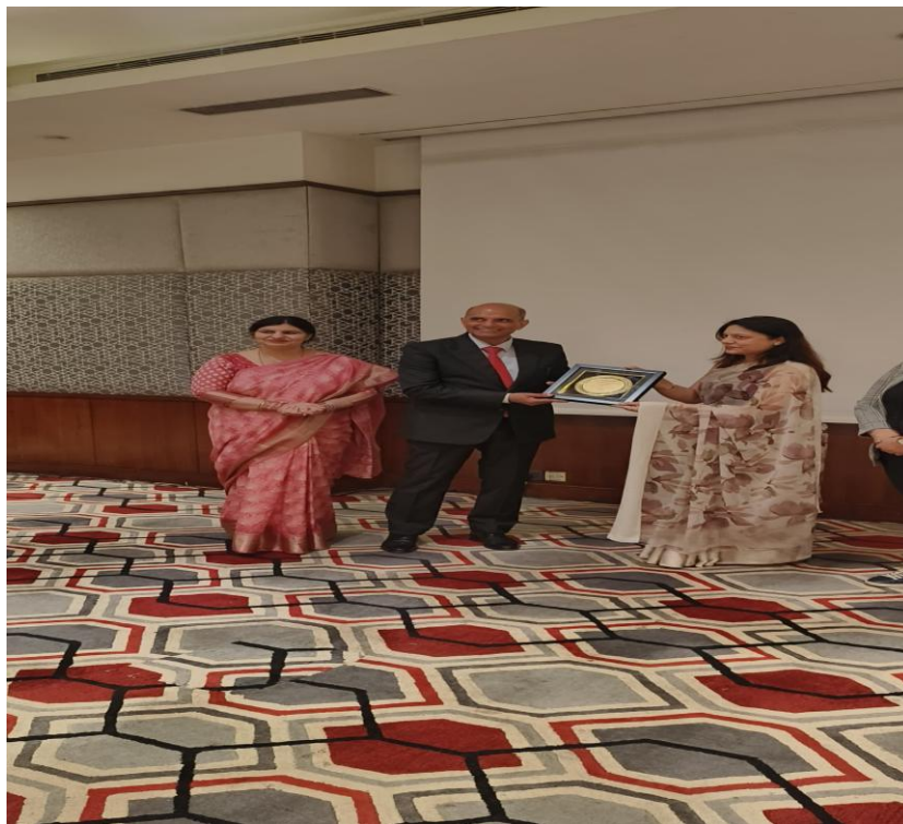
Pic 11- Memento presentation to session chair