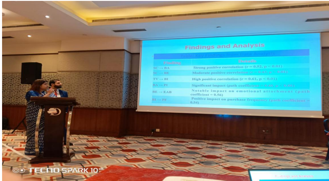
Pic 12: Participants presenting their original research work during the technical sessions