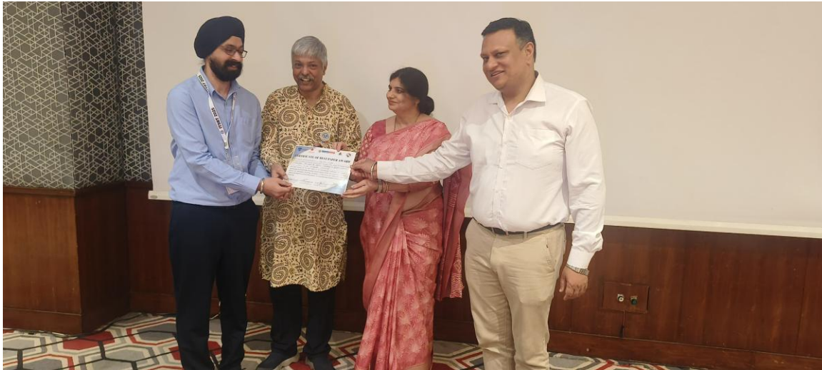
Pic 21- Best Paper Award – Young Scientist award