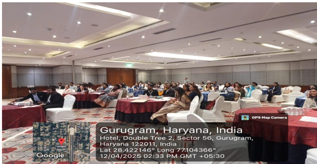
Pic 13- Participants attentively listening and interacting during research paper presentations, showcasing deep interest and curiosity