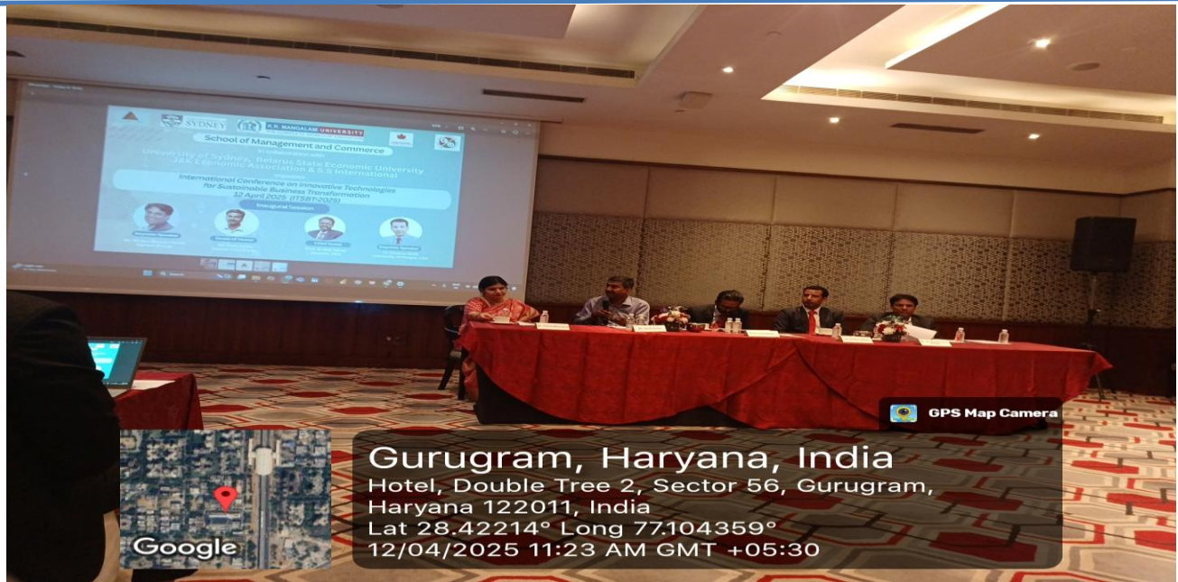
Pic 2- Inaugural Function