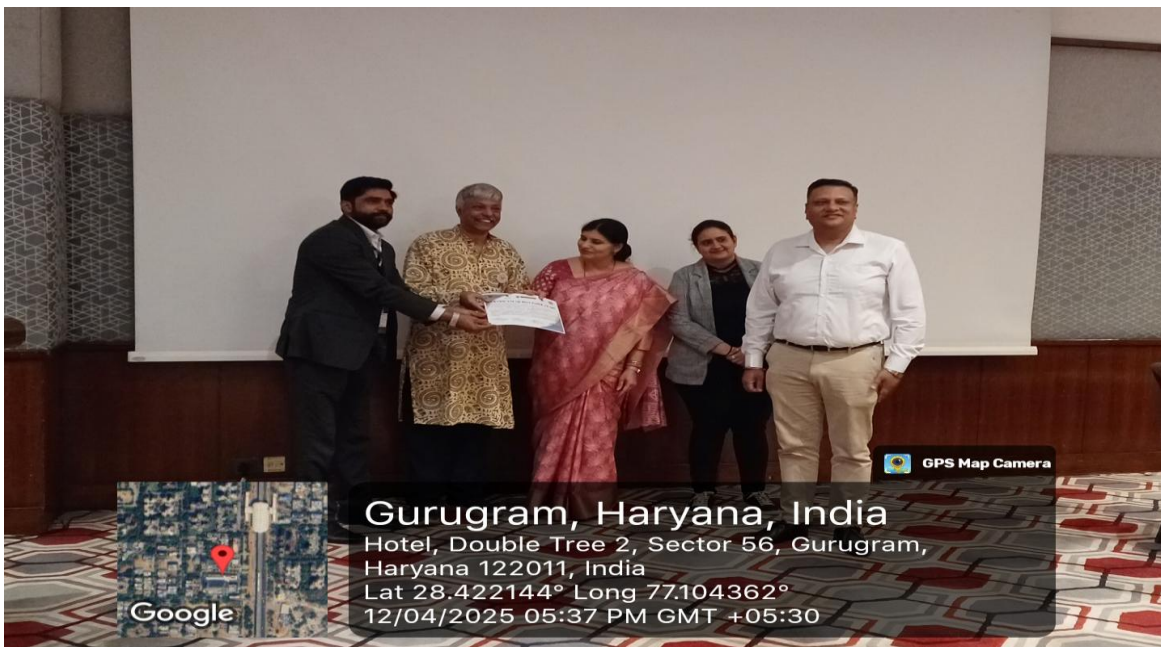
Pic 22- Certificate distribution