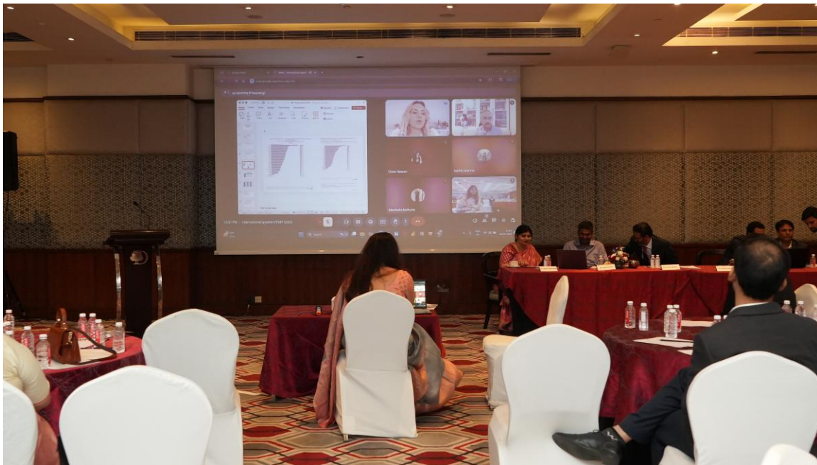
Pic15: Online session