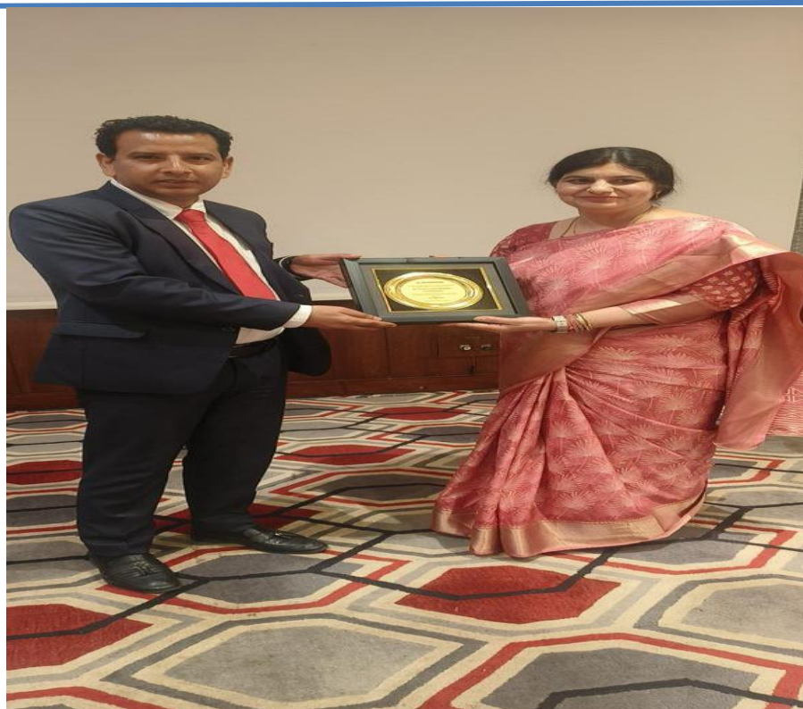
Pic 6- Felicitation of distinguished guests and keynote speakers in honor of their valuable presence and contributions.