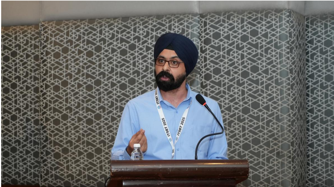
Pic 16- Authors presenting research paper