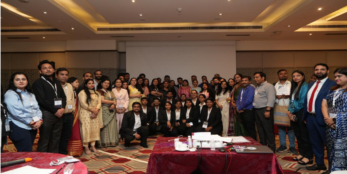
Pic 25: Collective photograph capturing the success of ITSBT-2025 with all guests, speakers, faculty, and participants.