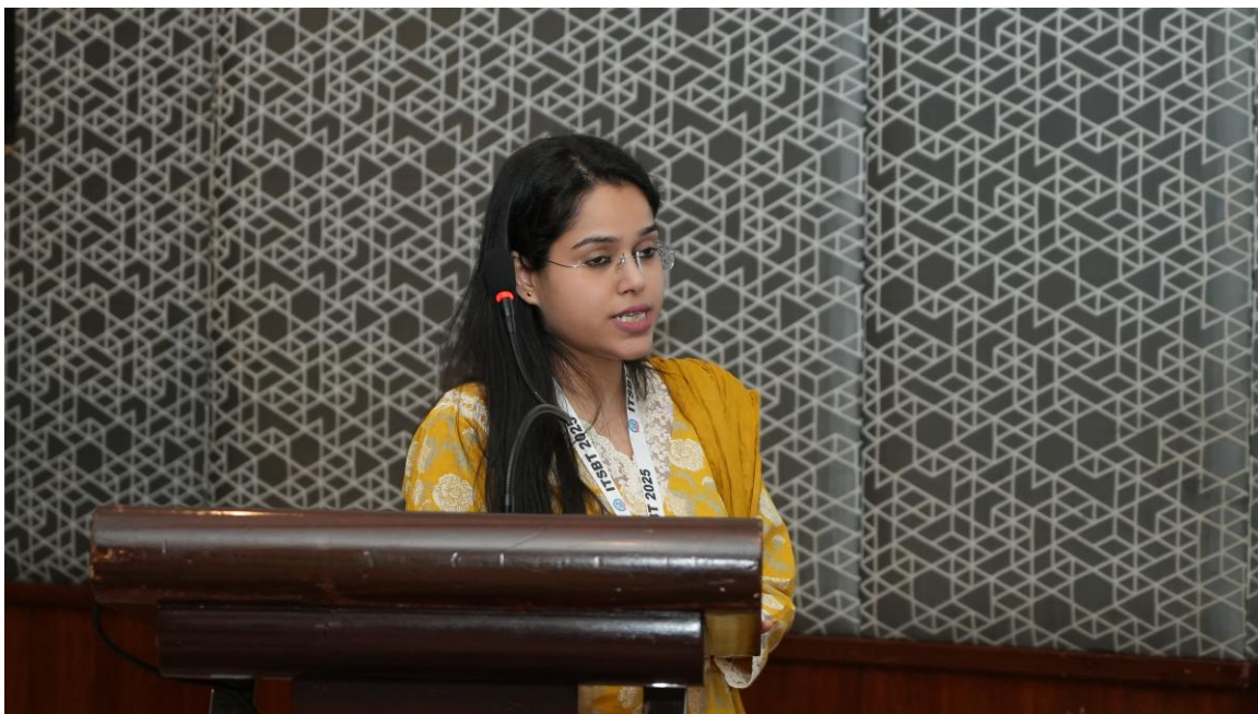
Pic 17- Authors presenting research paper