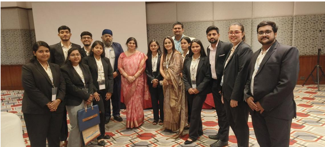
Pic 26: Dedicated student volunteers of SOMC, whose tireless efforts made ITSBT-2025