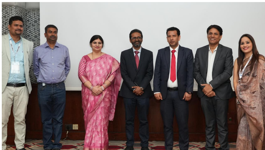
Pic7- Group photograph with our esteemed guests and dignitaries at ITSBT-2025