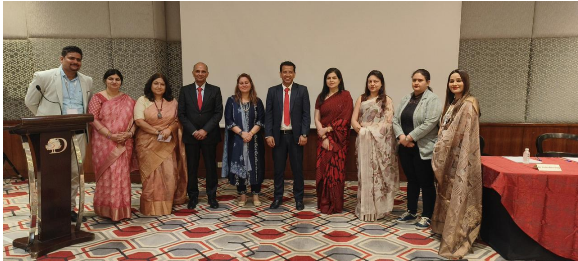
Pic 10: A moment with our session chairs who led engaging academic discussions across all tracks