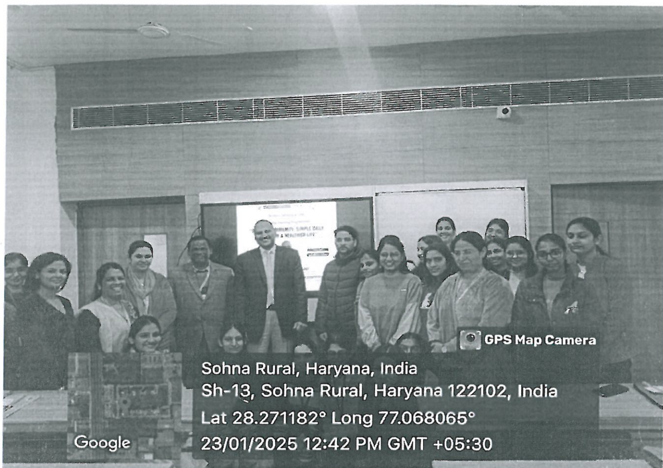
Photo 5: Participants of Life Skills Training Programme On Boosting Immunity: Simple Daily Habits for a Healthier Life