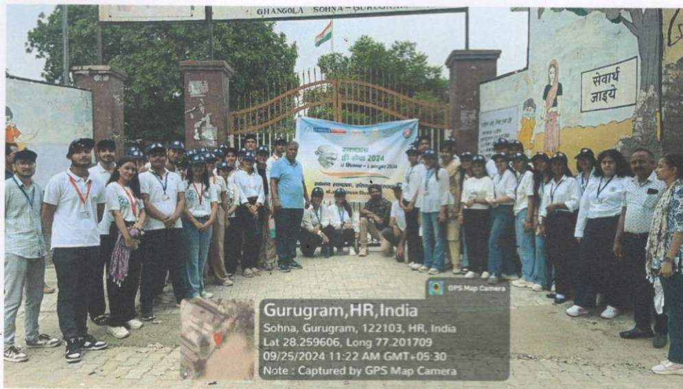
Photo 3: A group photograph of NSS volunteers and school faculties