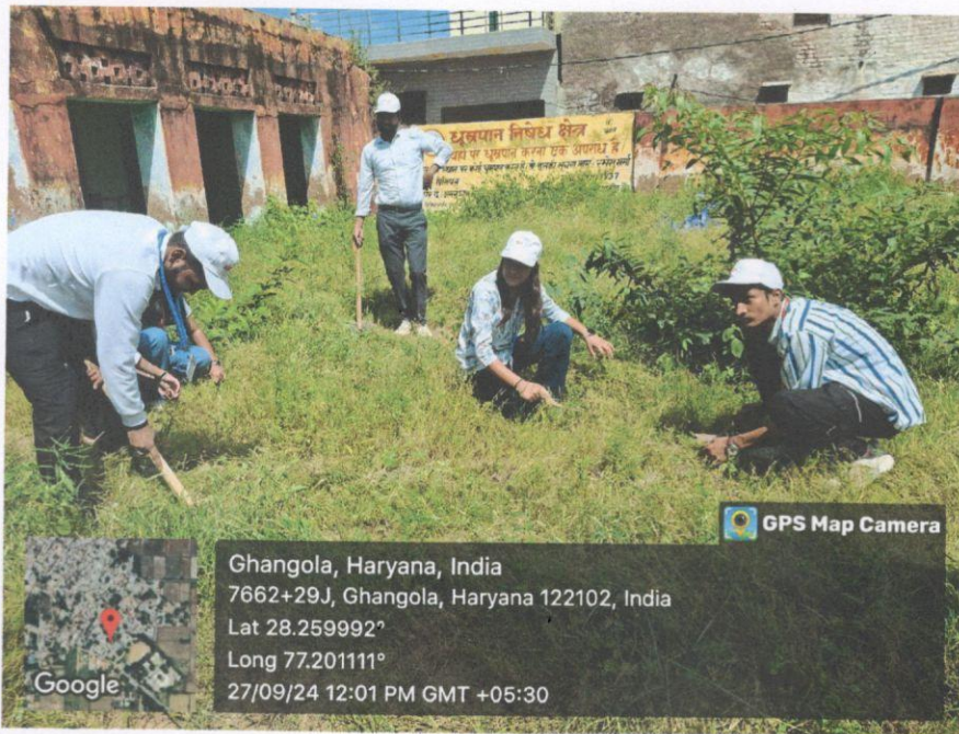
Photo 4: NSS volunteers during cleanliness drive on 27 th September 2024